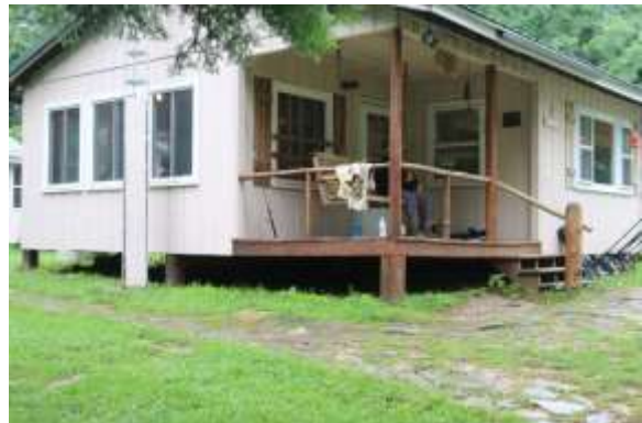
Northeast Side, Front Porch