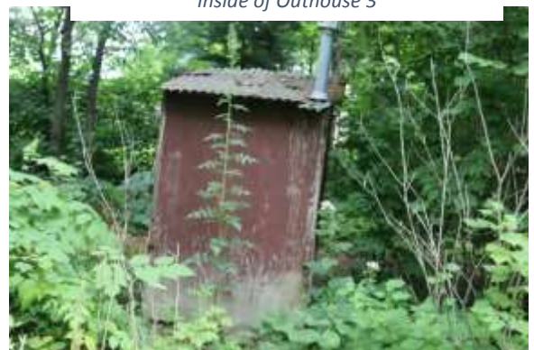
Back of Outhouse 3