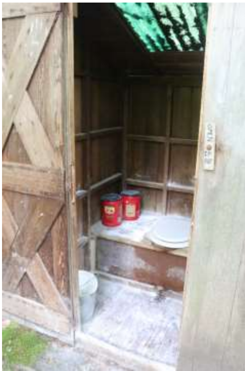
Inside of Outhouse 4