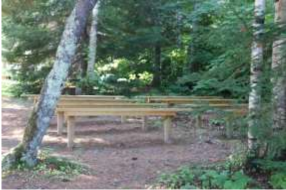
South View, From West Dock