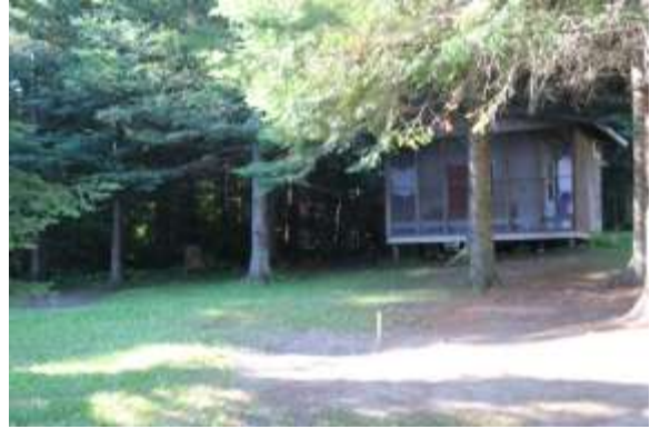
North Side, Screened in Porch