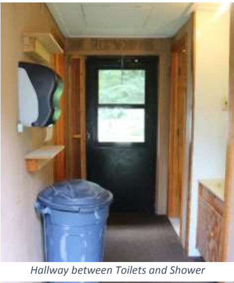
Hallway between Toilets and Shower