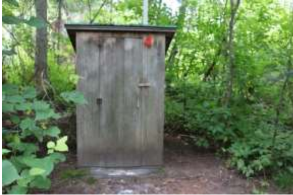
Front of Outhouse 4