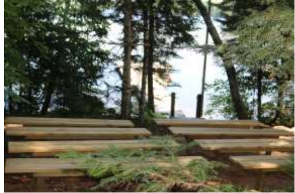
North View from back of Chapel