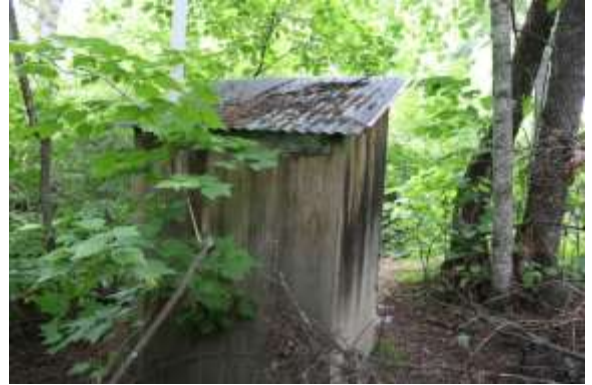
Back of Outhouse 4