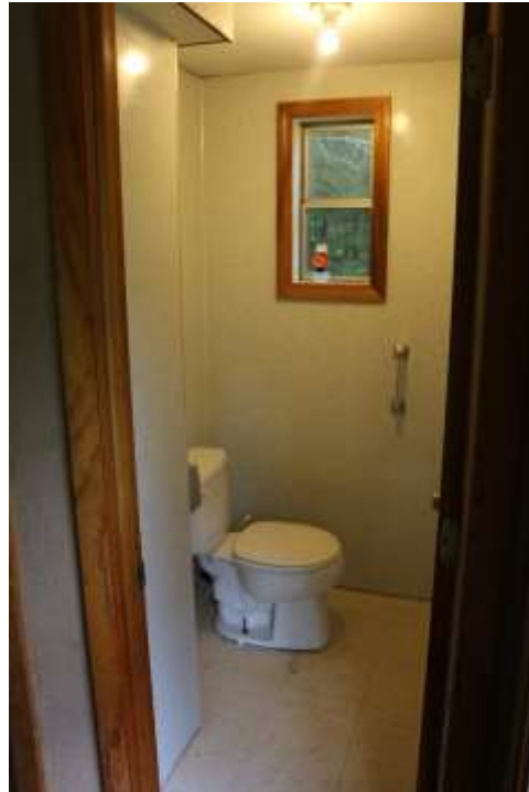
1 of 2 Toilets