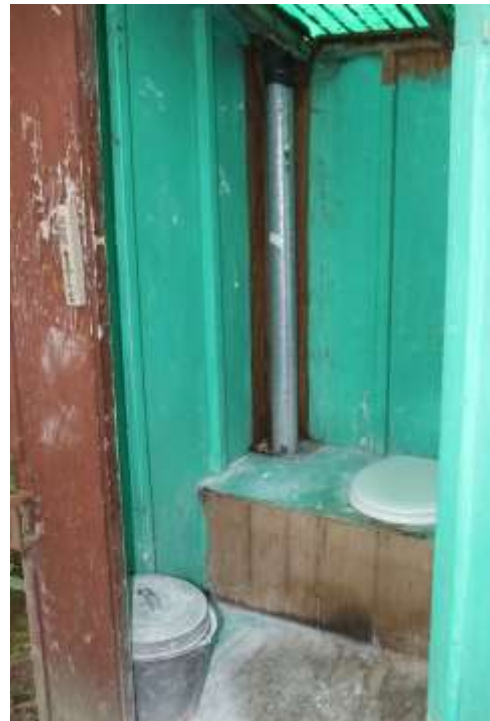
Inside of Outhouse 3