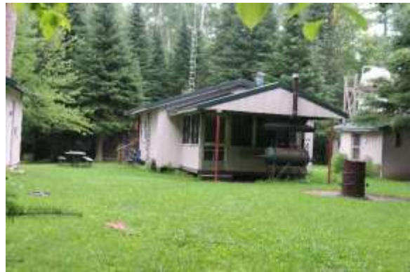
East Side of Building, Grilling Porch