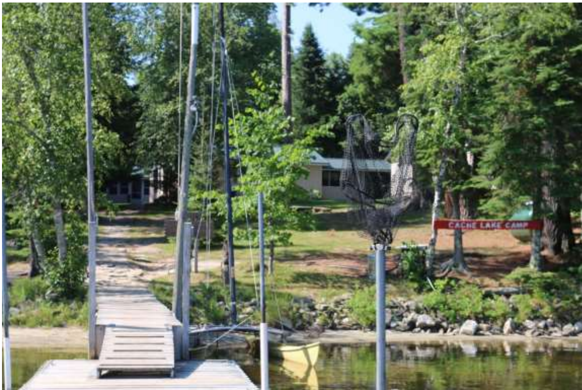
South View, Center Dock foreground and Dining Hall in background