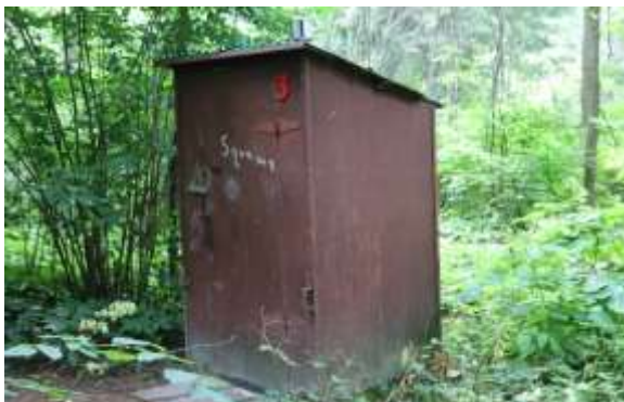
Front of Outhouse 3