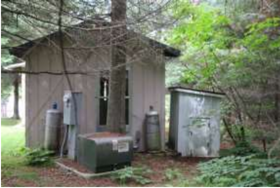
South Side, Camps Main Electric Input