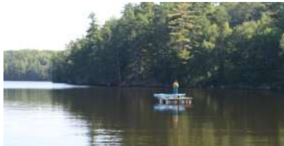
Anchored in the Bay with four 5-gallon buckets filled with cement