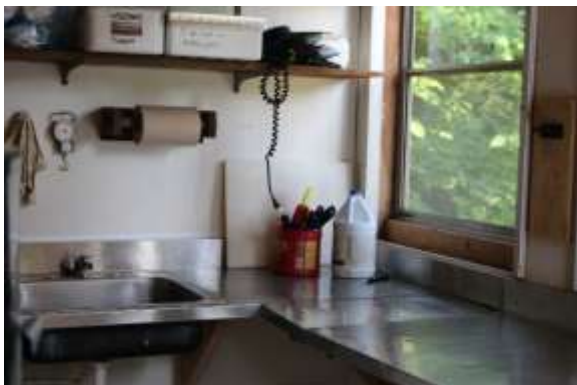
Inside the Fish Shack