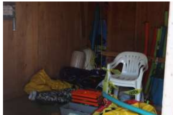
Inside Boat House