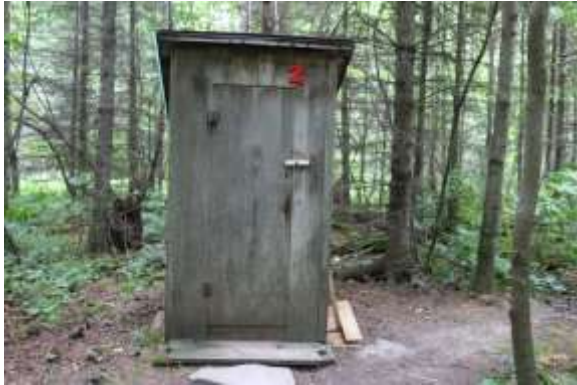
Front of Outhouse 2