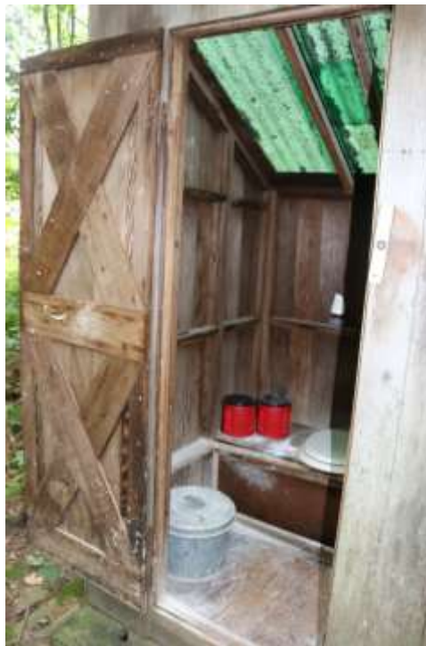
Inside Outhouse 2