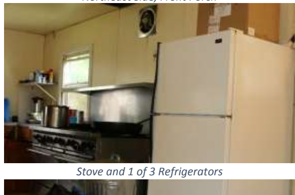
Stove and 1 of 3 Refrigerators