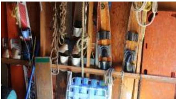
Inside Boat House