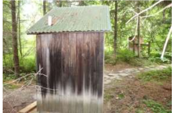
Back of Outhouse 2